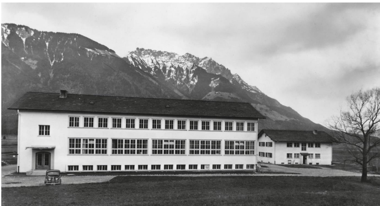
Building Contina AG, Mauren Liechtenstein, 1948/1949

At the board of directors' meeting on 8 June 1948, Curt Herzstark reported that 100 sales prototypes were to be built and that mass-produced calculating machines could be delivered in the first quarter of 1949. This was probably wishful thinking, because according to the audit report of the Swiss Trust Company (Schweizerische Treuhandgesellschaft) of 26 July 1950, only 215 calculating machines were accounted for in 1949 and 54 machines with defects continued to be used for the company's own needs.